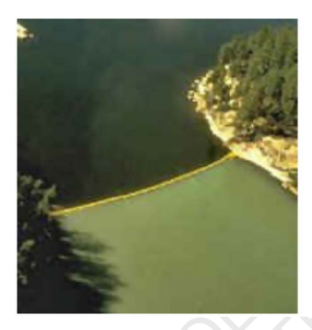
Figure 1. Lake 226 – Manitoba (Source: Experimental Lakes Area, or ELA. (n.d.). University of Manitoba Viewed 6 April, 2006, available: http://www.dfo-mpo.gc.ca/regions/central/pub/ela-rle/index_e.htm.)