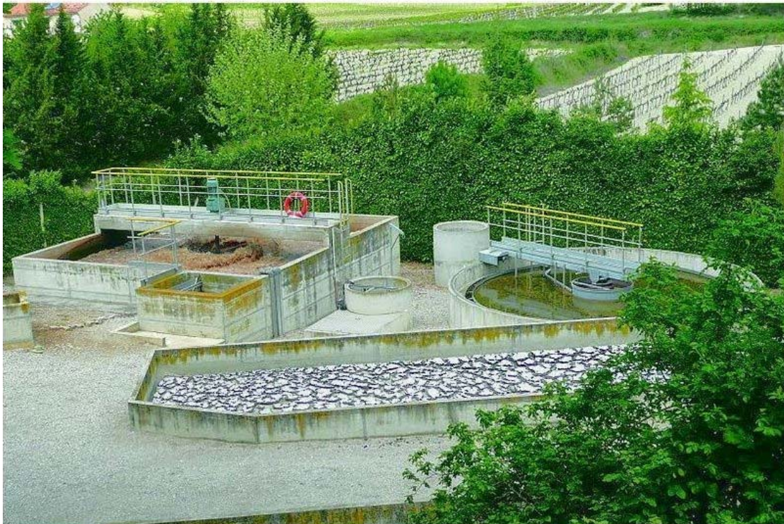
Figure 2. Sedimentation tanks

For advanced primary treatment, chemicals are added to enhance the removal of suspended solids and, to a lesser extent, dissolved solids. In secondary treatment, biological and chemical processes are used to remove most of the organic matter. In advanced treatment, additional combinations of unit operations and processes are used to remove residual suspended solids and other constituents that are not reduced significantly by conventional secondary treatment.