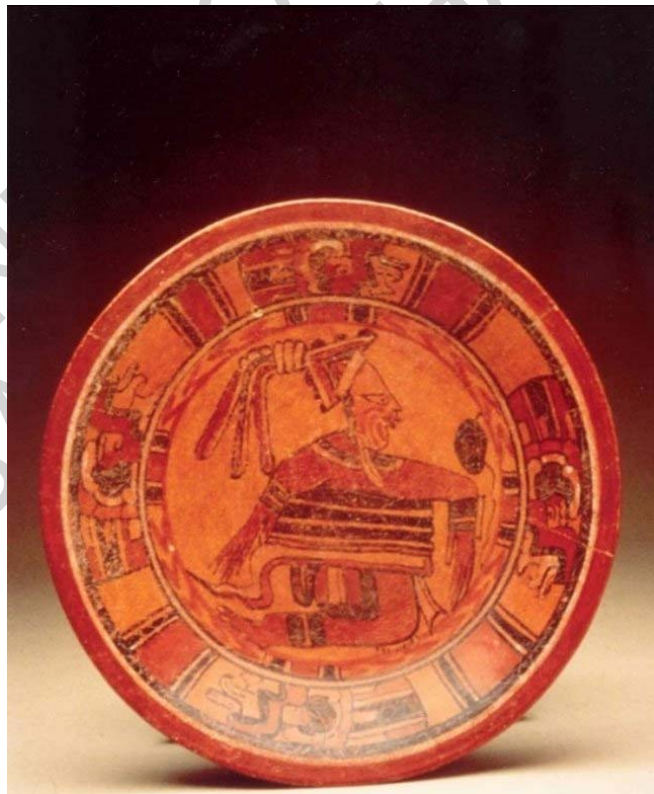
Figure 3: Player with Rubber Ball

Some of the natural materials exploited by man, such as wood, bone, plant and animal fibers, and fur, are polymeric-based materials. Rubber trees are native of the Gulf of Mexico and, not surprisingly, it was from this part of the world that we found the first evidence of the exploitation of rubber, not for an essential of life, but for sport. There are records from as early as 400–200 BC, and extending over a period of more than 1000 years, of a ball game played with a large rubber ball. In some versions of the game, the hands were used, whereas in others, the ball players wore heavy padding and hit the ball with upper arms, thighs and waist (Figure 3).